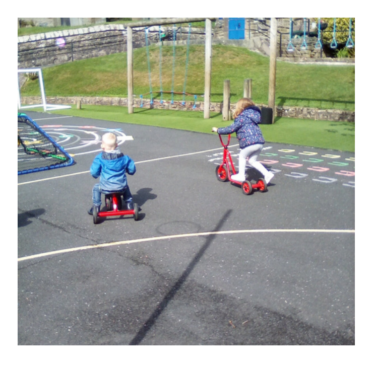
WINCLE PRE-SCHOOL IS A STIMULATING, NURTURING ENVIRONMENT IN WHICH EVERY CHILD FLOURISHES INTO LITTLE EXPLORERS AND LOVERS OF LEARNING.

Children are welcome to wear elements of the school's uniform but must be wearing footwear appropriate for playing and exploring.